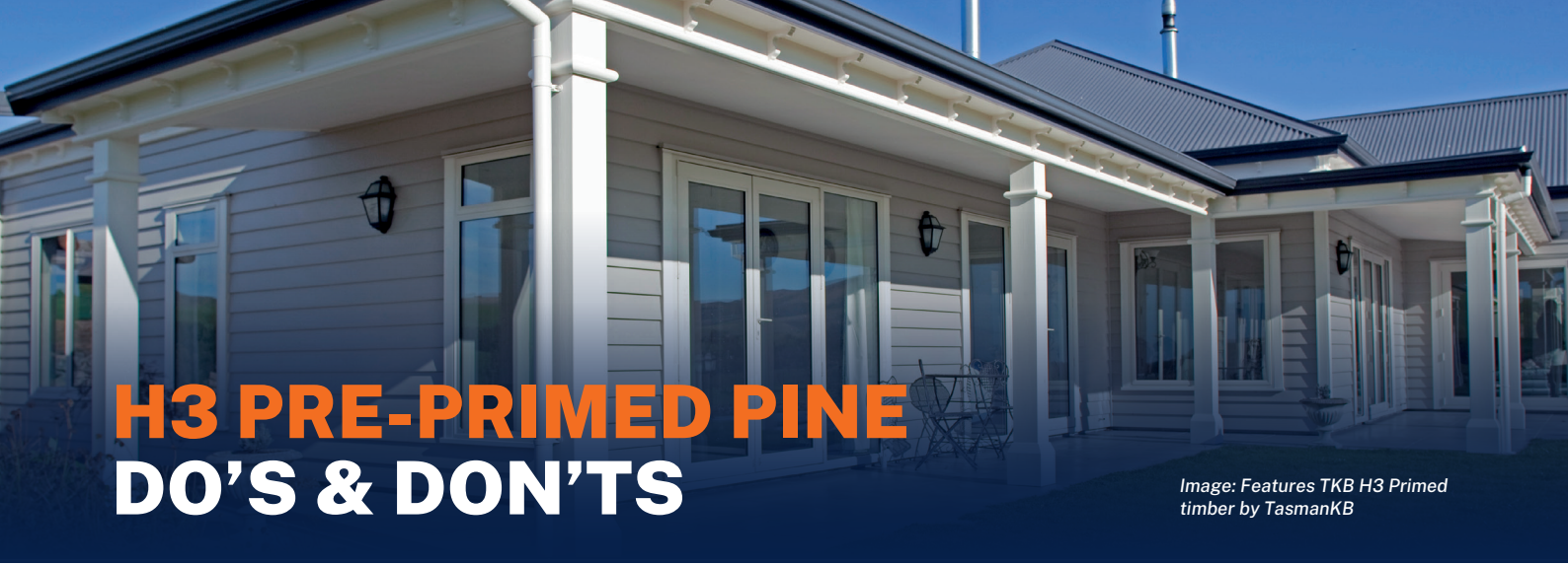
Image: Features TKB H3 Primed timber by TasmanKB